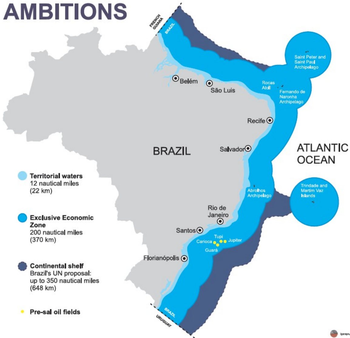
Figure 1. Brazilian Territorial Sea, EEZ and Continental Shelf extension required (“Blue Amazon”) 8

Brazil holds more than 7,400 km of coastline (around 9,200 km considering its curves and indentations) facing the Atlantic Ocean, located between the Oiapoque River (04°52'45” N) and Chuí River (33°45'10” S). The Coastal Zone was defined by the Decree