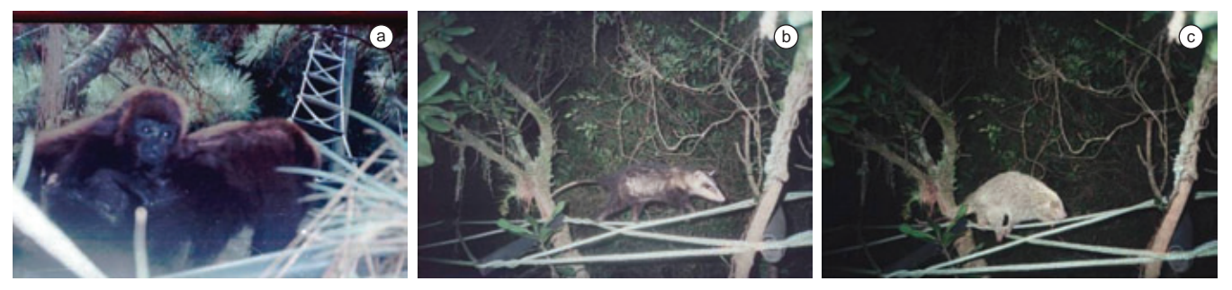
Figure 3. Species recorded using canopy bridges by camera traps. a) Brown-howler-monkey (Alouatta guariba clamitans Cabrera, 1940). b) White-eared-opossum (Didelphis albiventris Lund, 1840). c) Porcupine (Sphiggurus villosus Cuvier, 1823).