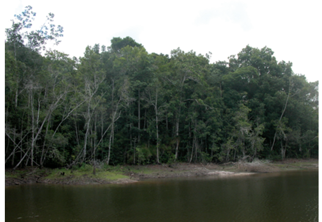
Figure 2. Photo of Mata do Açude in Usina São João representing the vegetation types where Oecomys catherinae was collected during field work.

In the Brazilian Atlantic Forest we found individuals identified as O. catherinae occurring from Joinville, in the state of Santa Catarina, the type locality (Cherem et al. 2004, Carleton et al. 2009), to the state of Espírito Santo (Pinto et al. 2009a, b). However, although Musser & Carleton (2005) and Costa et al. (2008) state that O. catherinae occurs from the states of Santa Catarina to Bahia, the only register of