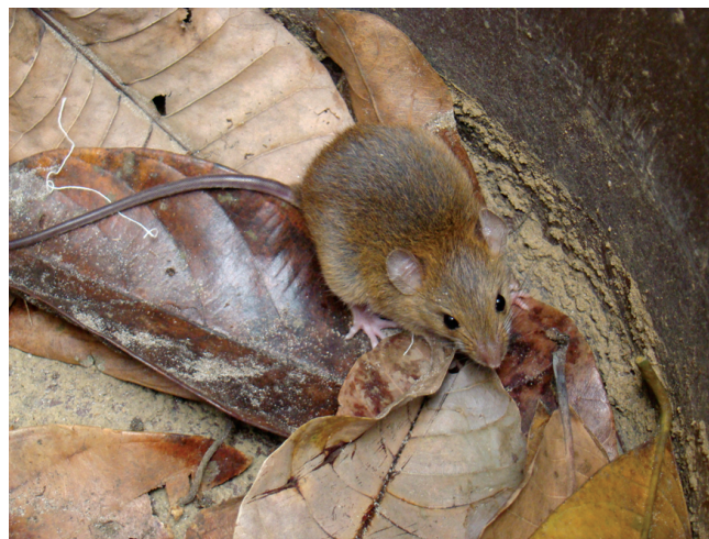
Figure 1. Individual of Oecomys catherinae (UFPE1890) trapped in Guaribas Biological Reserve. Juvenile male.

Live-traps (Sherman® of three different sizes: height: 10/7.5/10 cm, width: 8/9/11 cm, depth: 30.5/23/38 cm and Tomahawk® height: 15 cm, width: 14 cm, depth: 41 cm) were